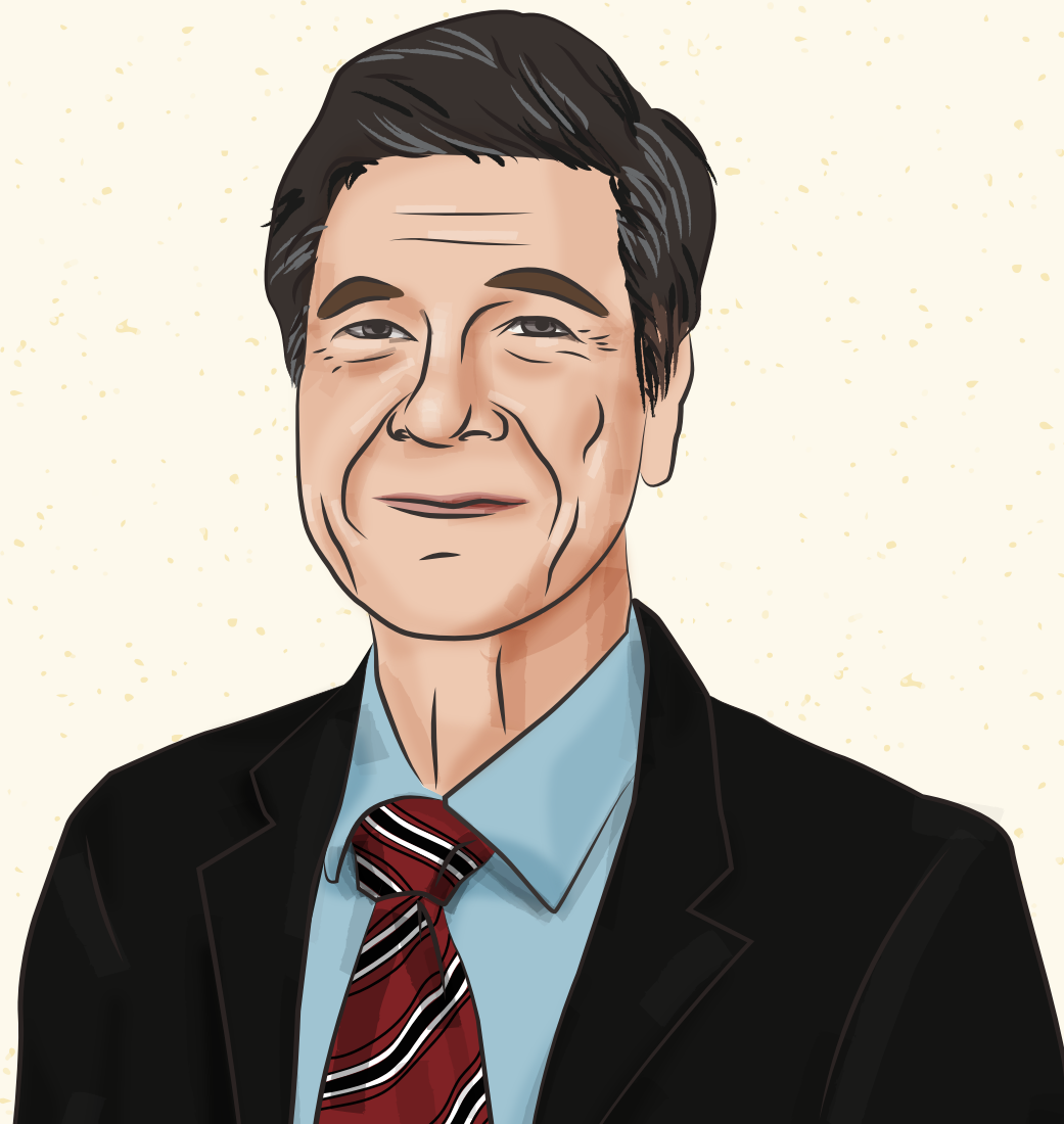
Jeffrey D. Sachs