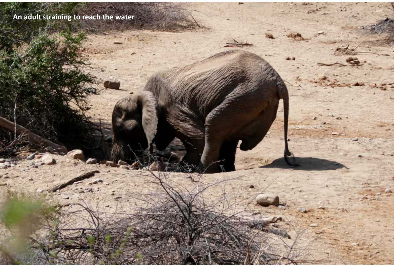
An adult straining to reach the water

Our solution has been to employ warriors to maintain access ramps into the wells. They renovate each well every morning, so that even baby elephants can walk into the well and drink safely. We had 6 teams during the height of the dry season. They simply dig a big ramp into the wells, so that all wildlife can come and go safely and without collapsing the well. This has been a huge success. After 5 years, the elephants have learned to use the ramps and drink safely. There is almost no tension between the community and the wildlife. Everybody can drink in safety.