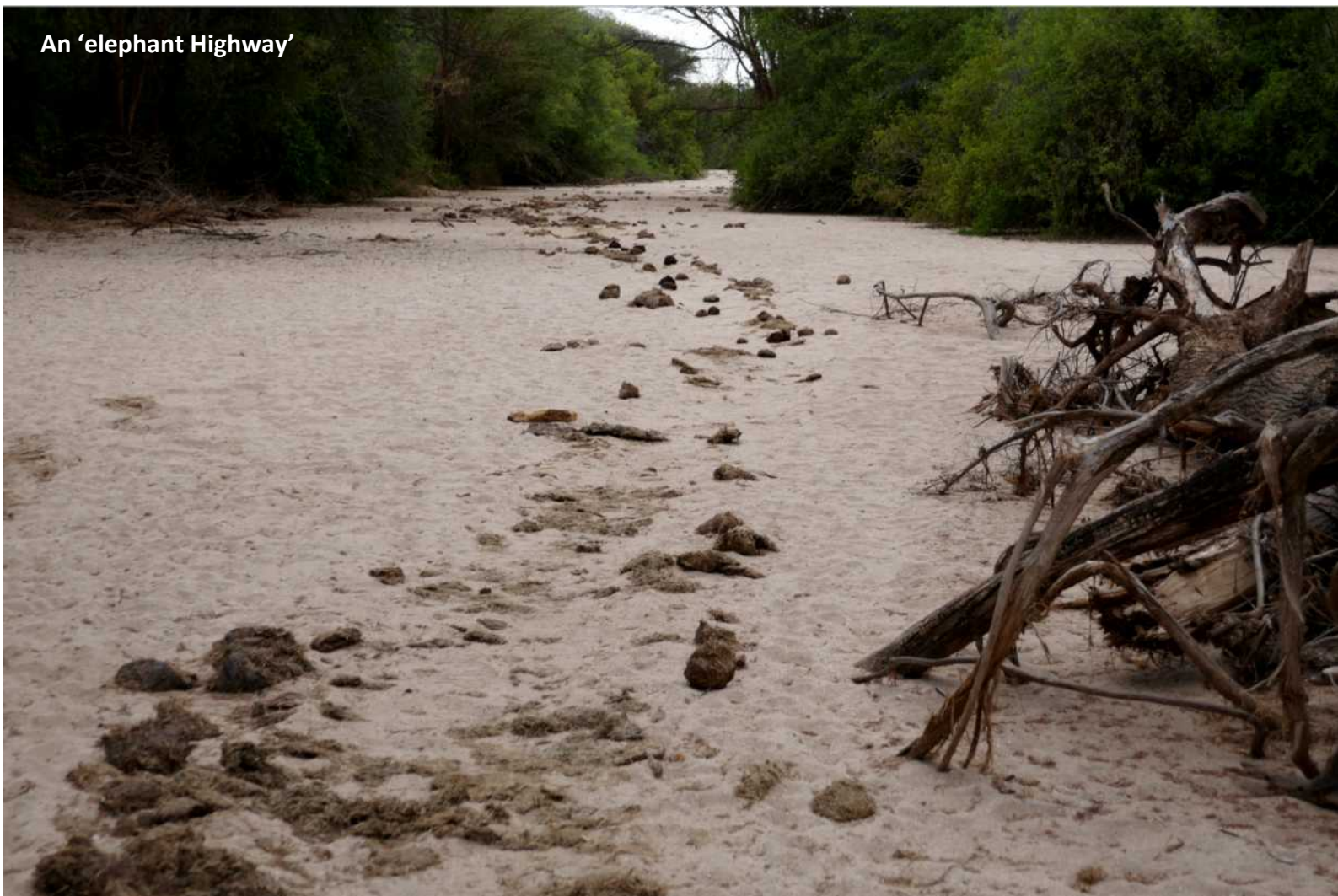
An 'elephant Highway'

So, In 2015 we were thrilled to receive support from Gro Brundtland, through the Tang Prize foundation. This program could not have come at a better time, and has enabled us to develop four main aspects of our elephant conservation program – communications, ranger program, elephant wells and veterinary.