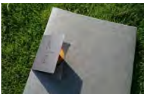
Golden Pin Award