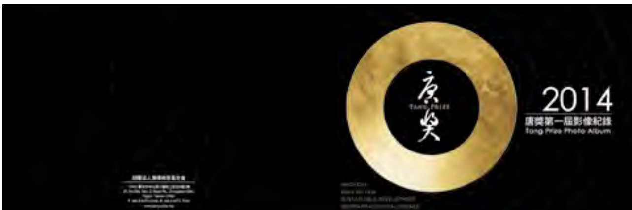
唐獎第一屆影像紀錄 2014 Tang Prize Photo Album