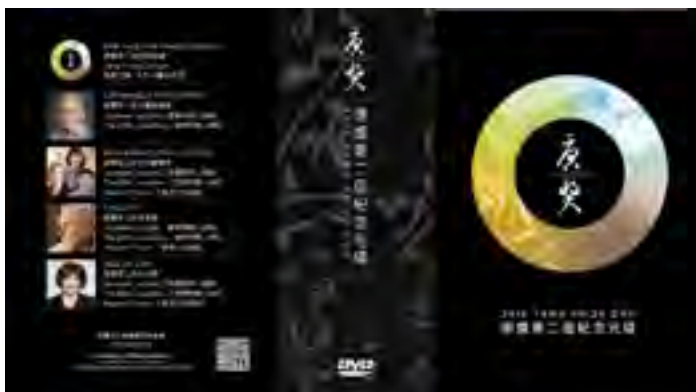
唐獎第二屆紀念光碟 2016 Tang Prize DVD