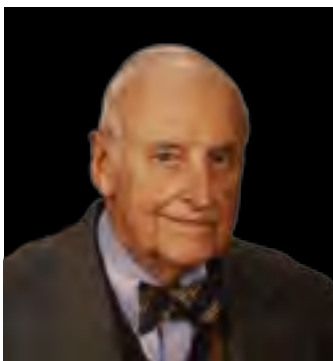
狄培理（美國） William Theodore de Bary (U.S.A.)

Arthur H. Rosenfeld pioneered efficient energy use. Thanks to his efforts, global energy consumption and greenhouse gas emissions have been dramatically reduced, earning him the moniker “the Godfather of Energy Efficiency.” He founded the Center for Building Science at Lawrence Berkeley National Laboratory, which launched a series of important scientific and technological initiatives, vigorously promoting new energy policies and substantially increasing energy efficiency. Scientists have even adopted the term “Rosenfeld” as a new measurement unit for energy savings.