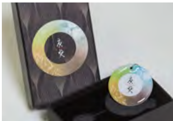
唐獎第二屆紀念悠遊卡 2016 Tang Prize Easy Card