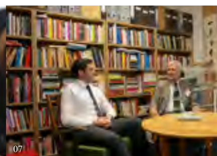
fig.1-3 唐獎執行長出席亞洲研究學會 2015 年會 Tang Prize CEO attends the 2015 Association for Asian Studies (AAS) annual meeting