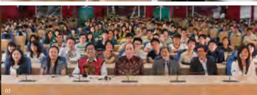
fig.1-3 第二屆生技醫藥獎得主珍妮佛·道納北一女演講 2016 Biopharmaceutical Science laureate Doudna speaks at Taipei First Girls High School