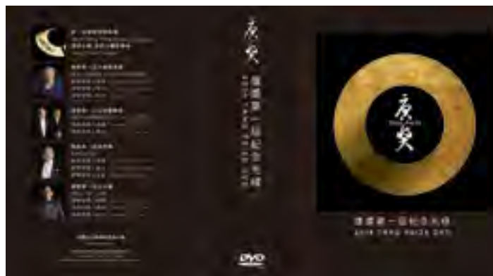
唐獎第一屆紀念光碟 2014 Tang Prize DVD