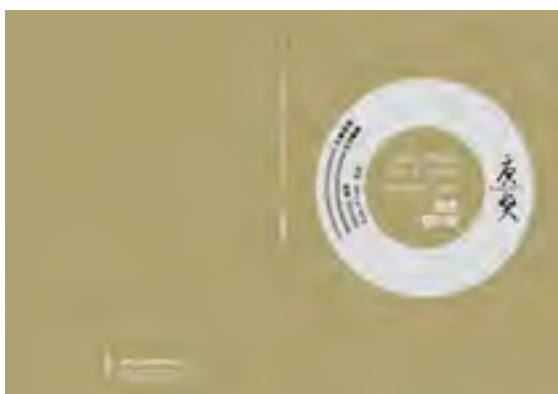
唐獎第一屆雙年報 2013-2014 Tang Prize Biennial Book