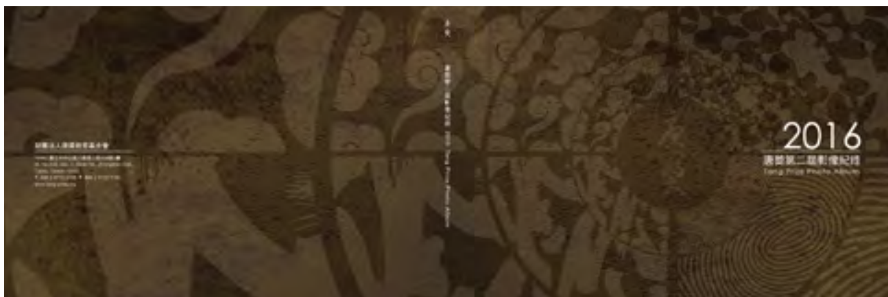
唐獎第二屆影像紀錄 2016 Tang Prize Photo Album