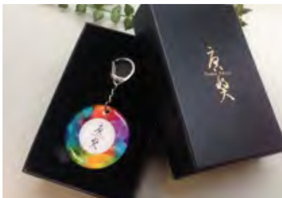
唐獎第一屆紀念悠遊卡 2014 Tang Prize Easy Card