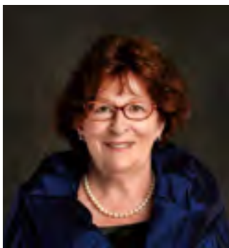
路易絲·阿爾布爾（加拿大） Louise Arbour (Canada)