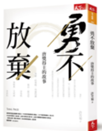
唐獎第一屆得主專書 Book on 1 st Tang Prize Laureates