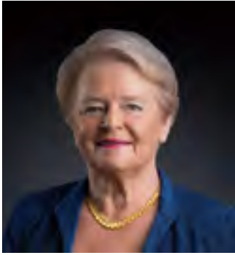
格羅·哈萊姆·布倫特蘭（挪威） Gro Harlem Brundtland (Norway)