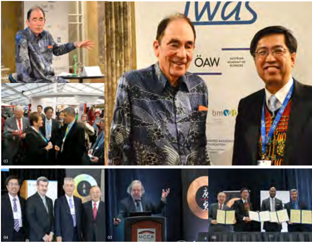
fig.1-2 第一屆法治獎得主奧比·薩克思出席世界科學院年會 2014 Rule of Law laureate Albie Sachs at The World Academy of Sciences