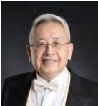
余英時（美國） Yu Ying-shih (U.S.A.)

Gro Harlem Brundtland was awarded for her innovation, leadership and implementation of sustainable development that laid out the scientific and technical challenges for the global community to achieve a better balance of economic development, environmental integrity, and social equality for the benefit of all humanity.