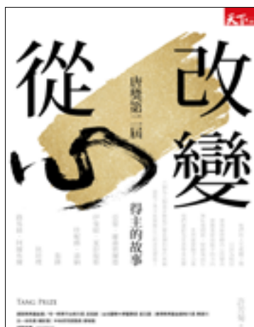
唐獎第二屆得主專書 Book on 2 nd Tang Prize Laureates